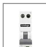
switched neutral pole, 1P+N